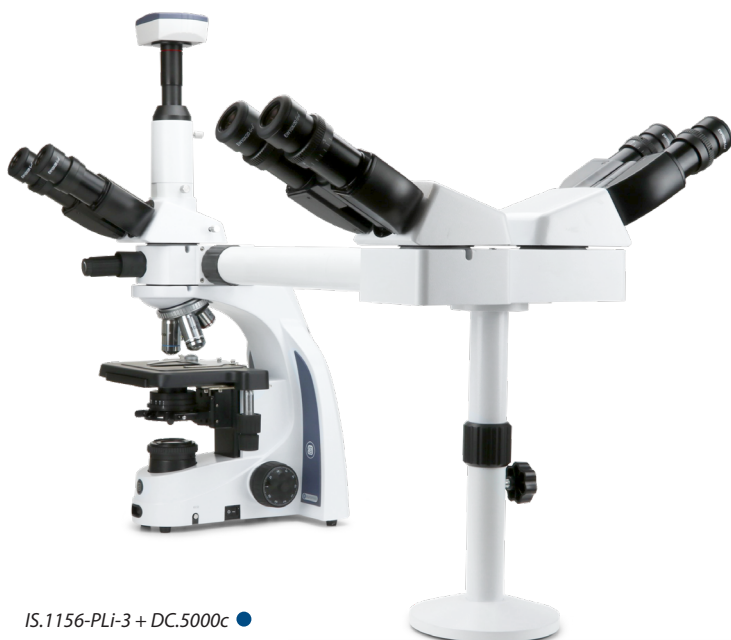
IS.1156-PLi-3 + DC.5000c ●